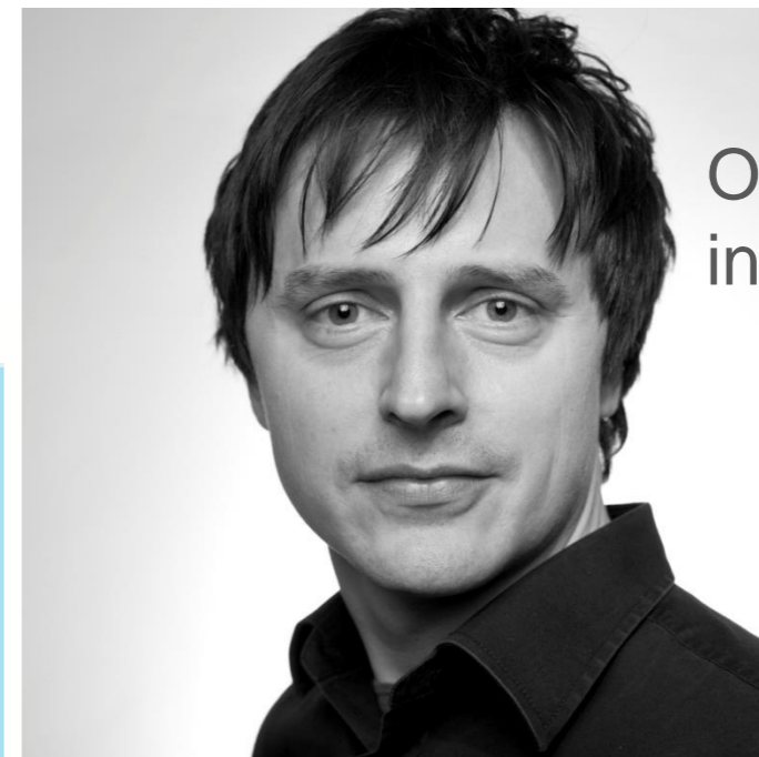
OSKAR ZIĘTA industrial design